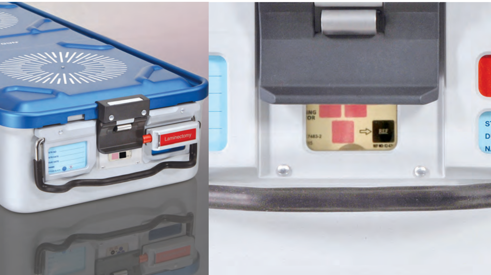
Window For Emulating Indicator